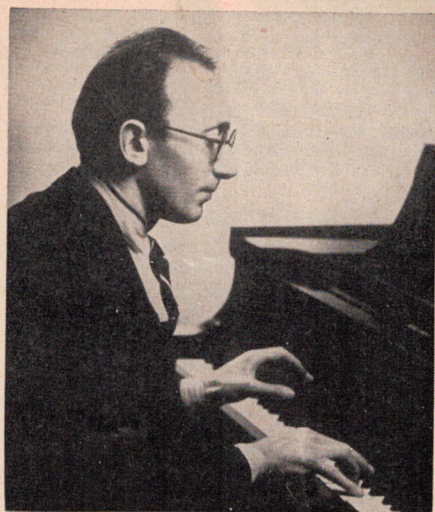
Clifford Curzon, famed British pianist, in L.M.C. concert at the Met, Feb. 5.